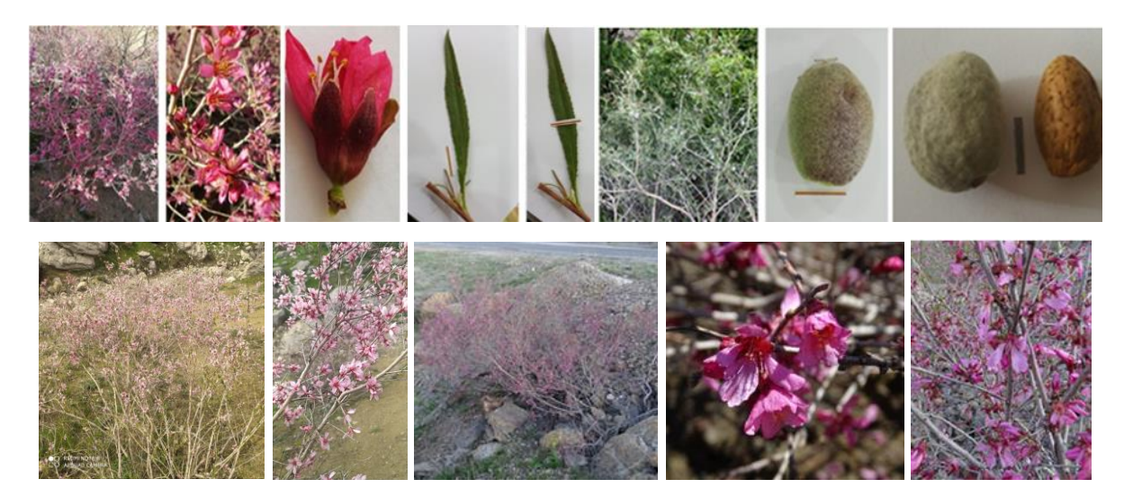
Figure 12. Habitat, form, flower, leaf and fruit of P. carduchorum

Habitat and Distribution: On rocky slopes with limestone or metamorphic rocks, in Astragalus zones or open degraded forest. Growing at elevations between 1500 - 3000 m.