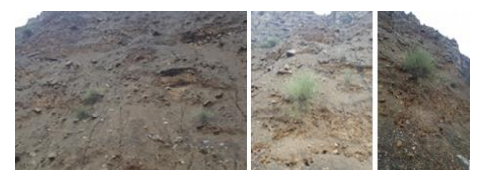
Figure 14. P. arabica on eroded slopes in Hakkâri

Habitat and Distribution: In arid and semi arid regions, on limestone and volcanic rocky slopes, mountains and savannas; often along riversides, and gorges, dry gullies and ravines, open degraded forest and on eroded slopes (Fig. 14). Growing at elevations between 500 - 2700 m (Yazbek, 2010).