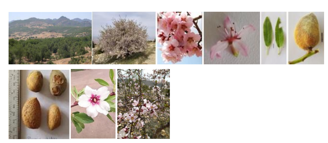
Figure 2. Stands, habitat, form, flower, leaf, fruit and stone of P. dulcis