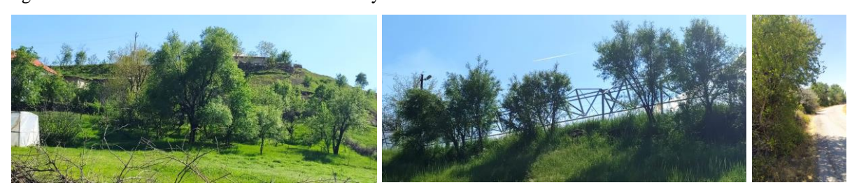
Figure 4. P. dulcis in gardens in Derecik (Hakkâri) and as a border plant in Golbasi (Adıyaman)