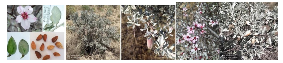
Figure 9. Habitat, form, flower, leaf and fruit of P. orientalis

Habitat and Distribution: Common in open grazed oak forest, open sunny niches, on rocky limestone sloppy hillsides, also on dry silt and on steep river stream banks. Growing at elevations between 500 - 2000 m., but most frequently between 800 and 1200 m altitudes (Browicz 1972), (Yazbek, 2010). In Anatolia, it generally spreads in arid, calcareous and stony areas. The annual rainfall in the areas where it grows is between 250 mm and 450 mm (Grasselly, 1976).