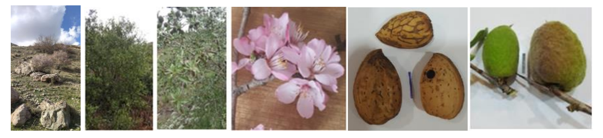
Figure 8. Habitat, form, flower, leaf fruit and stone of P. trichamygdalus var. elongata

Habitat and Distribution: On limestone and igneous soils, on cliffs and rocky places, particularly along gorges. Growing at elevations between 950-2500 m (Yazbek, 2010).