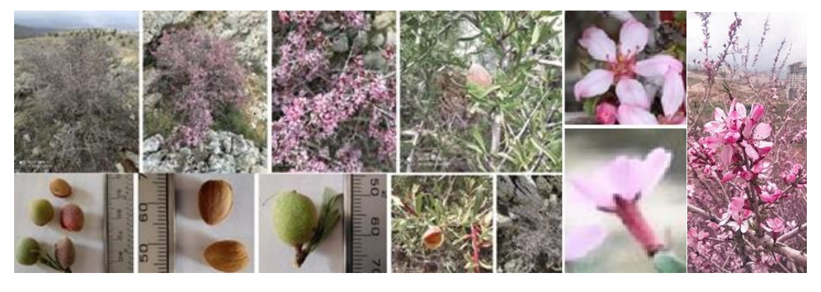
Figure 15. Habitat, form, flower, leaf and fruit of P. lycioides