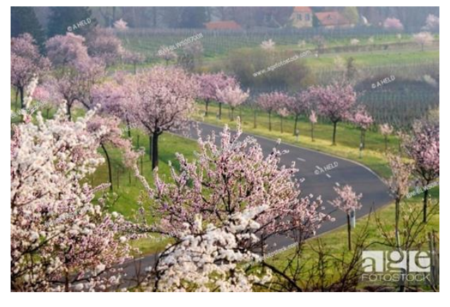
Figure 5. P. dulcis in cultural landscape in Germany