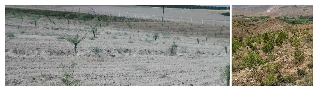
Figure 3. P. dulcis in cultivated for fruit in Malatya

Whereas nowadays it is cultivated as a fruit tree in temperate regions all over the world and Türkiye (Fig. 3), in England it is never likely to be valued in gardens for good eatable nuts and it is for its beauty of flower alone that it is cultivated (Url 1). However, being exposed to spring late freezes, unlike usually cultivated for its fruit, it is planted as a border plant in gardens (Fig. 4) and for afforestation in barren areas in Central Anatolia or rainfed areas (Kaşka et al., 1999; Küden and Küden, 2000). Also it was used in aveneu in German (Fig. 5), (Url 3).