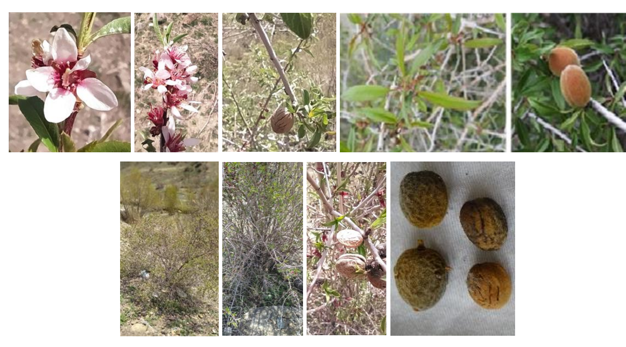
Figure 6. Flower, leaf and fruit, form and stone of P. fenzliana in Hakkâri

Habitat and Distribution: In forests and shrub lands, mostly on rocky slopes and cliffs, and frequently in ravine. Growing at elevations between 1400 - 3500 m (Yazbek, 2010).