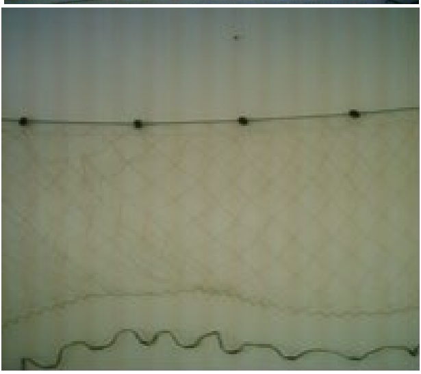
Figure 3. Used with multifilament and monofilament selvedge nets

Experimental (A1 and A2) nets were added selvedge. A1 nets have selvedge with multifilament material and A2 nets have selvedge with monofilament (Figure 3).