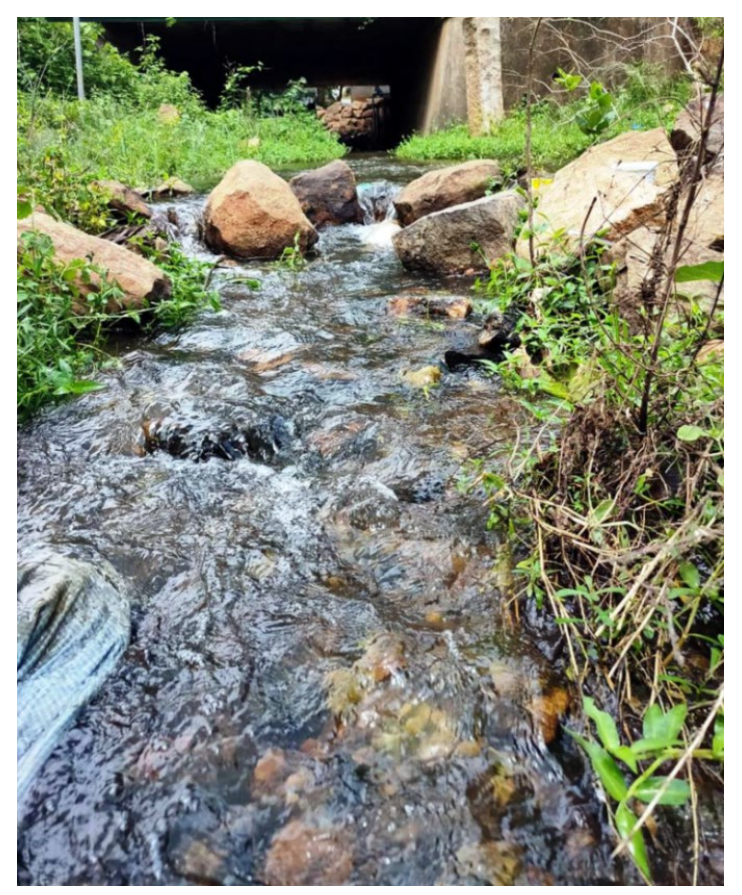
Figure 1. Habitat of Caenis nigropunctatula Malzacher, 2015

The specimens were collected from the Vaigai River, Madurai, Tamil Nadu, India (Figure 1). 7 larvae were collected using a D net and all of them were subsequently reared into imago in the laboratory and were collected and preserved in 80% ethanol. The imagos of C. nigropunctatula were easily reared from mature nymphs having dark wing pads and they can become imagos within a week in the rearing tank at 32°C without any aeration and food. Adult characteristics of C. nigropunctatula were studied using Magnus MSZ binocular stereo microscope and photographs were acquired using Canon EOS 1500D. Specimens studied under Scanning electron microscope were first dehydrated using ethanol and dried by critical point drying and examined with an EVO-18 scanning electron microscope at 10 k. Digital SEM photographs were made and edited with Adobe Photoshop 7.0. Terminologies were followed based on Malzacher (1991) for male genital sclerites and Kluge (1994) for thoracic structures. The distributional map of Caenis nigropuctatula was done with the help of the software SimpleMappr (Shorthouse 2010). The collected specimens are deposited in the American College Museum (AMC), Madurai, and Tamil Nadu.