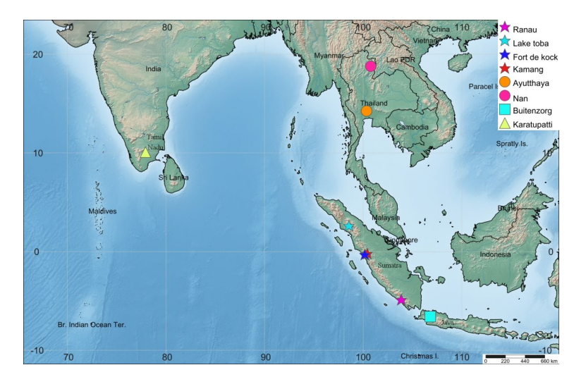
Figure 2. Distributional map of Caenis nigropunctatula Malzacher, 2015