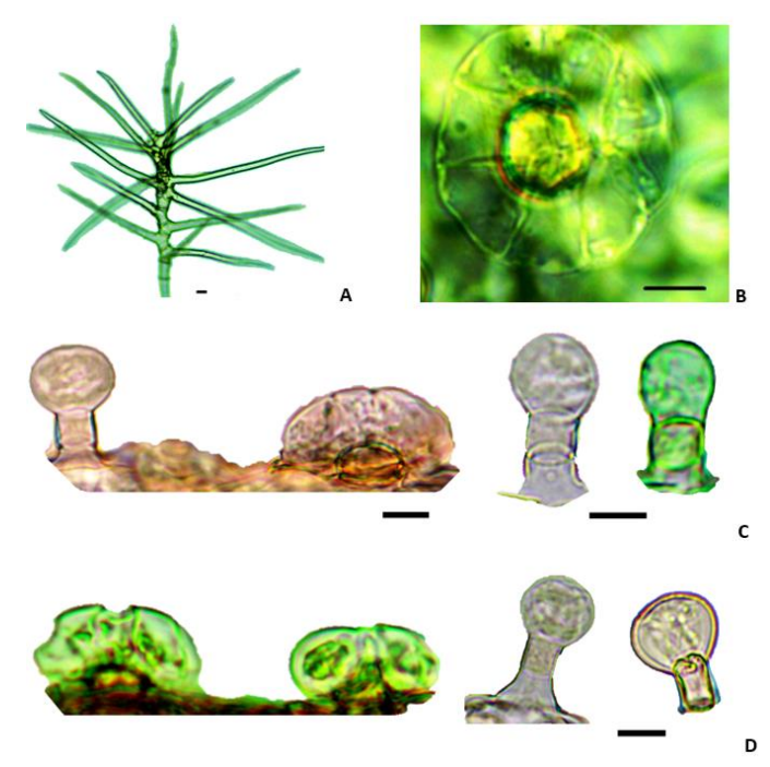
Figure 3. Light micrographs of trichomes of Ballota pseudodictamnus subsp. lycia. A- Dendroid trichome Bunicellular stalked with 8 cells head trichome on leaves C- glandular trichomes (capitate and peltate) on petiole D- glandular trichomes (peltate and capitate) on stem. Scale bars: 10 μm