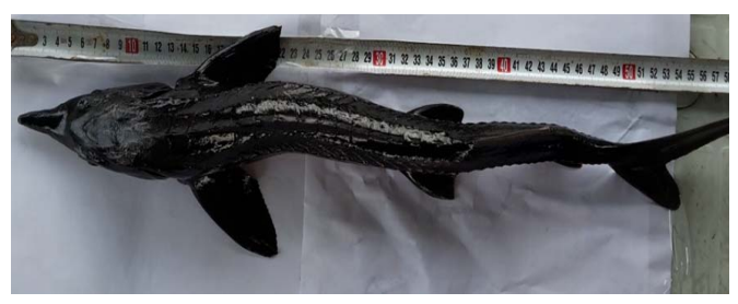
Figure 2. Scoliotic Siberian sturgeon (Acipenser baerii Brandt, 1869)

Skeletal disorders of farm fish require a constant struggle for the aquaculture industry. Skeletal deformities affect the overall performance of the fish, its growth and cause problems with fish health. Irregularly shaped fish also cause commercial loss due to the visual evaluation and grading of the product (Karahan et al., 2013; Harris et al., 2014). There is evidence in the farm fishes that the etiology of skeletal malformations are different from the living in a marine environment. These deformities are less visible in marine fish. In the case of marine species, malformations are