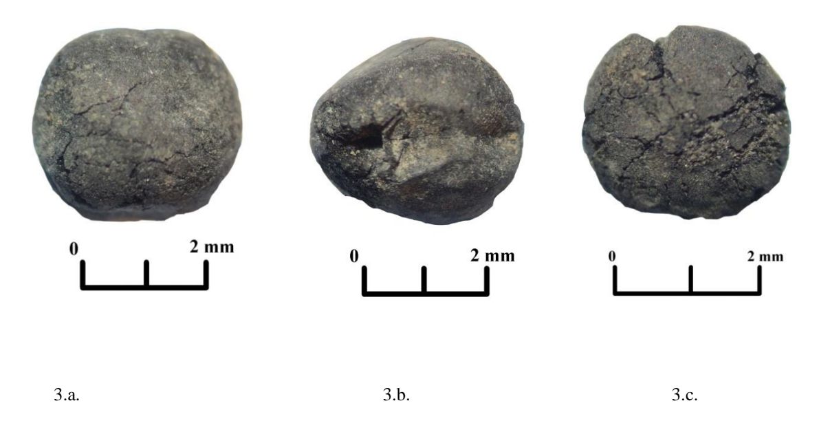
Figure 3.a-b. Lathyrus sativus, c. Lens culinaris

Pisum sp.: Only 2 seeds are detected (Figure 4b.).