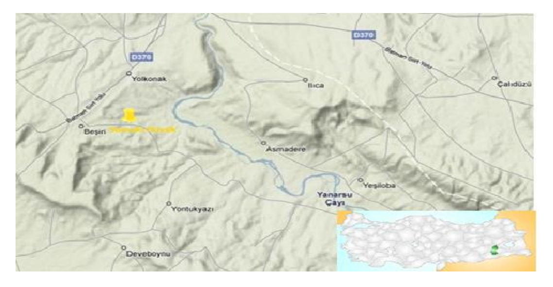
Figure 1: Location of Sumaki Höyük