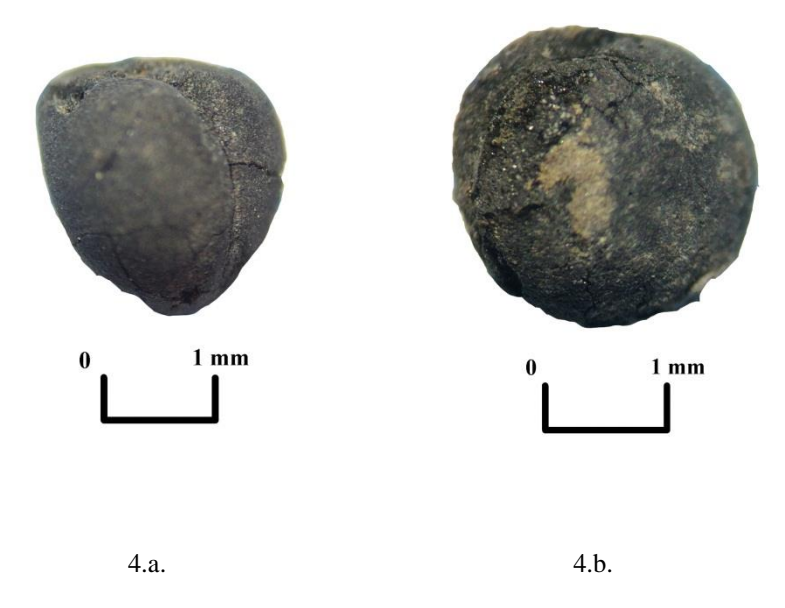
Figure 4.a. Vicia ervilia, b. Pisum sativum