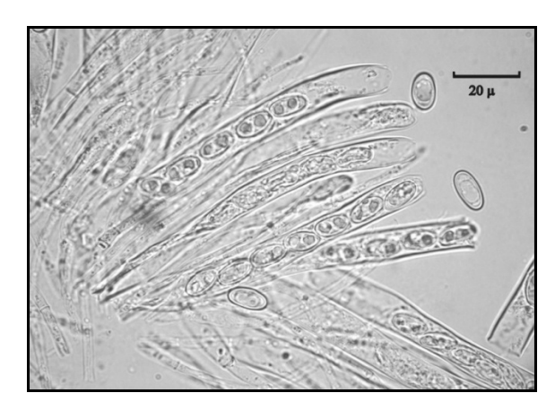
Fig 3. Ascus and Ascospores of Otidea onotica (Scale bar= 20 \mu ).