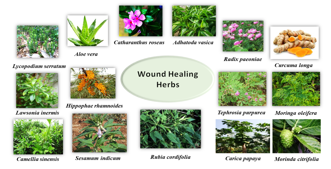
Figure 2. Some medicinal plants with wound healing activity.

In addition, many other potential herbs that have been assessed for their wound healing property are recapitulated in Tables (1 and 2). The image of medicinal plants with wound healing activity is prearranged in Figure 2.