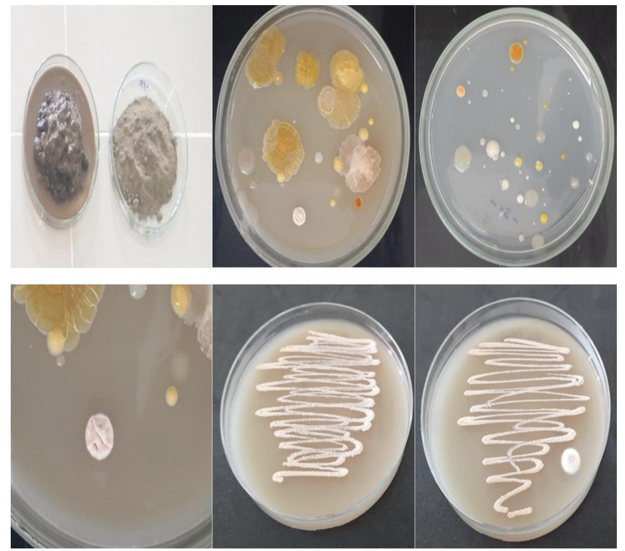
Figure 1. Streptomyces species isolated in the study growing on Bennet's agar.

Considering the spore chain morphology of the isolated Streptomyces species, it was seen that a knobby structure was formed (Figure 2).