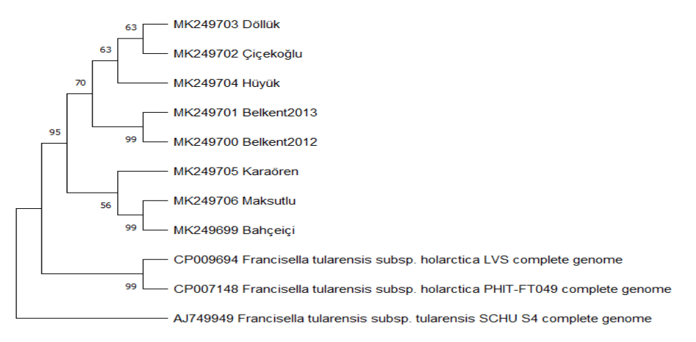
Figure 2 . Phylogenetic tree (Neighbor-joining, Kimura 2-parameters) based on 16S rRNA gene sequences comparing the F. tularensis subsp. holarctica strains of Sivas with other known GenBank records. Bootstrap percentage values from 1,000 replicates are located at nodes of the tree. Sequence alignments and tree generation were conducted in MEGA10.

gene region. Our samples were found to be 97.74 -98.49% similar to F. tularensis subsp. holarctica LVS (accession number CP009694) and 97.56 - 98.31% to F. tularensis subsp. holarctica PHIT-FT049 (accession number CP007148) in terms of 16S rRNA gene region (Figure 2). In a study conducted in Spain, 42 F. ularensis subsp. holarctica isolates were found to be similar in terms of 16S rNA gene region. The sequence detected in this study shared 99% similarity to those of strains from another Spanish outbreak of tularemia [17]. As a result of three gene-based phylogenetic analysis (tul4, fopA and 16S rRNA gene regions) of 10 F. ularensis subsp. holarctica strains isolated from China, the correlation not found between the genotype and the geographical area from which the bacteria were isolated [13].